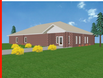
Rendering of future New Hope Clinic (by Carolina Coastal Designs, Inc.)

to seven months. The clinic will relocate to the new facility as soon as it is ready for occupancy. Contributions are being accepted to help finance the building and the future operations of the clinic. There are also options available for sponsoring individual rooms.