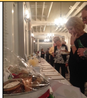
Bald Head Island Auction

Don't miss the next auction to be held on December 30, 2016 at the Bald Head Island Club!