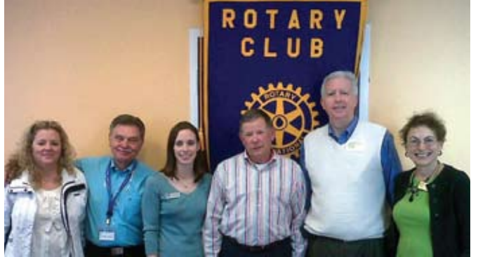
Thanks to the Rotary Club of Shallotte who collaborated with New Hope Clinic to receive a grant from Rotary International to improve access to online educational information for patients and providers and for making the clinic a safer place by purchasing four sturdy patient chairs for the medical exam rooms!